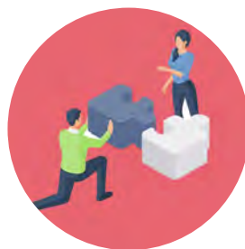
Mutually Reinforcing Activities